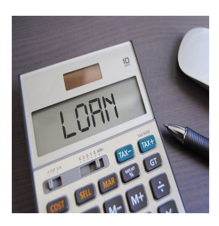
How to reduce NPA?